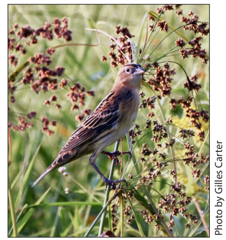
A female Bobolink in Pomfret

The male Bobolink is striking and unusual — black with white on the back and yellow on the back of the head. The female is buffy-colored with streaks on the back, crown and flanks. The female looks like a large sparrow. The birds arrive in Connecticut around the first week of May. Early in the nesting season it is common to see several males together chasing each other to establish nesting territory. The males will mate with more than one female in a season. In late summer, Bobolinks form flocks of up to 100 birds, usually found in weedy uncut fields. To nest successfully, Bobolinks must have fields that are not only big, they also have to be left unmowed well into the summer. In general, the safe date for mowing is August 1. Earlier safe dates can be set but that requires specific knowledge of the